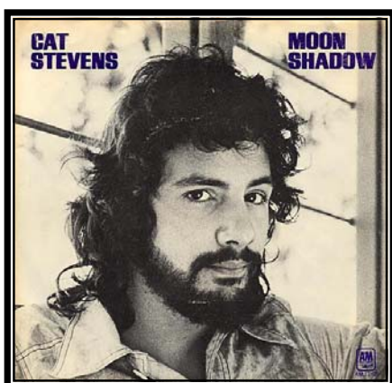
Cat Stevens when he was a pop star

All I have to say is all what you know already, to confirm what you already know the message of the Prophet ( pbuh ) as given by God - the Religion of Truth. As human beings, we are given a consciousness and a duty that has placed us at the top of creation. Man is created to be God's deputy on earth, and it is important to realize the obligation to rid us of all illusions and to prepare for the next life. Anybody who misses this chance is not likely to be given another, to be brought back again and again, because it says in Quran Majeed "that when man is brought to account, he will say, O Lord, send us back and give us another chance. The Lord will say; if I send you back, you will do the same."